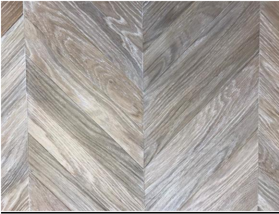
45° Chevron Pattern

See instructions in every carton for subfloor preparation, installation using Nydree Flooring MRA1585 adhesive, and maintenance procedures for either Pedestrian 2.0 or UV Oil Finish.