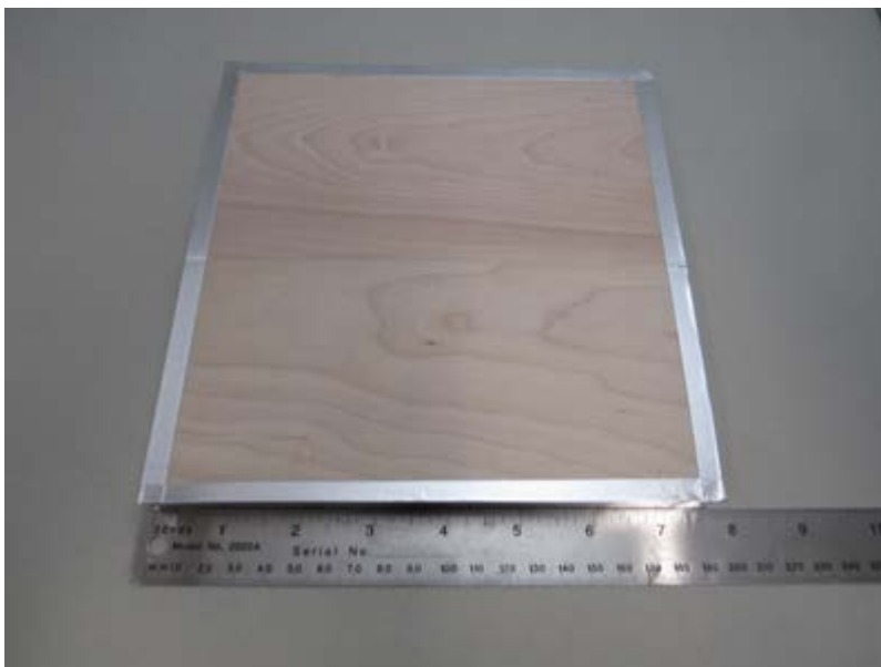
Photo Documentation – The product sample specimen is photographed immediately following specimen preparation and prior to initiating the conditioning period. Typically, the top and bottom faces of the specimen are photographed. Bottom faces may show a stainless-steel plate or other substrate if prescribed by the standard.